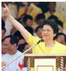
Corazon Aquino, Former President of the Philippines See "In The News" below

This is the monthly publication on women's issues, local and global, published by Fifty-Fifty Leadership, A non-profit organization promoting women's equal leadership